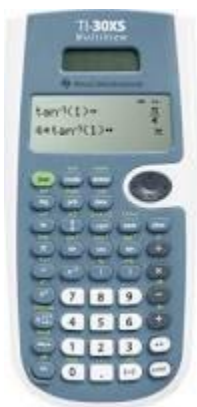
TI-30XS MultiView Calculator

Individual teams may request other items as needed.